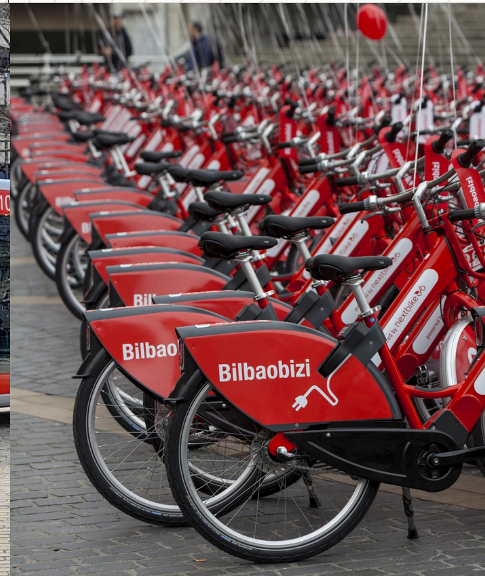
MUNICIPAL BIKE-SHARE SERVICE