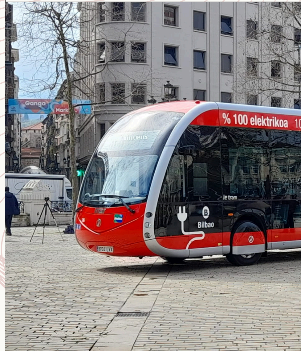
ELECTRIC, HYBRID, AND ACCESSIBLE BUSES